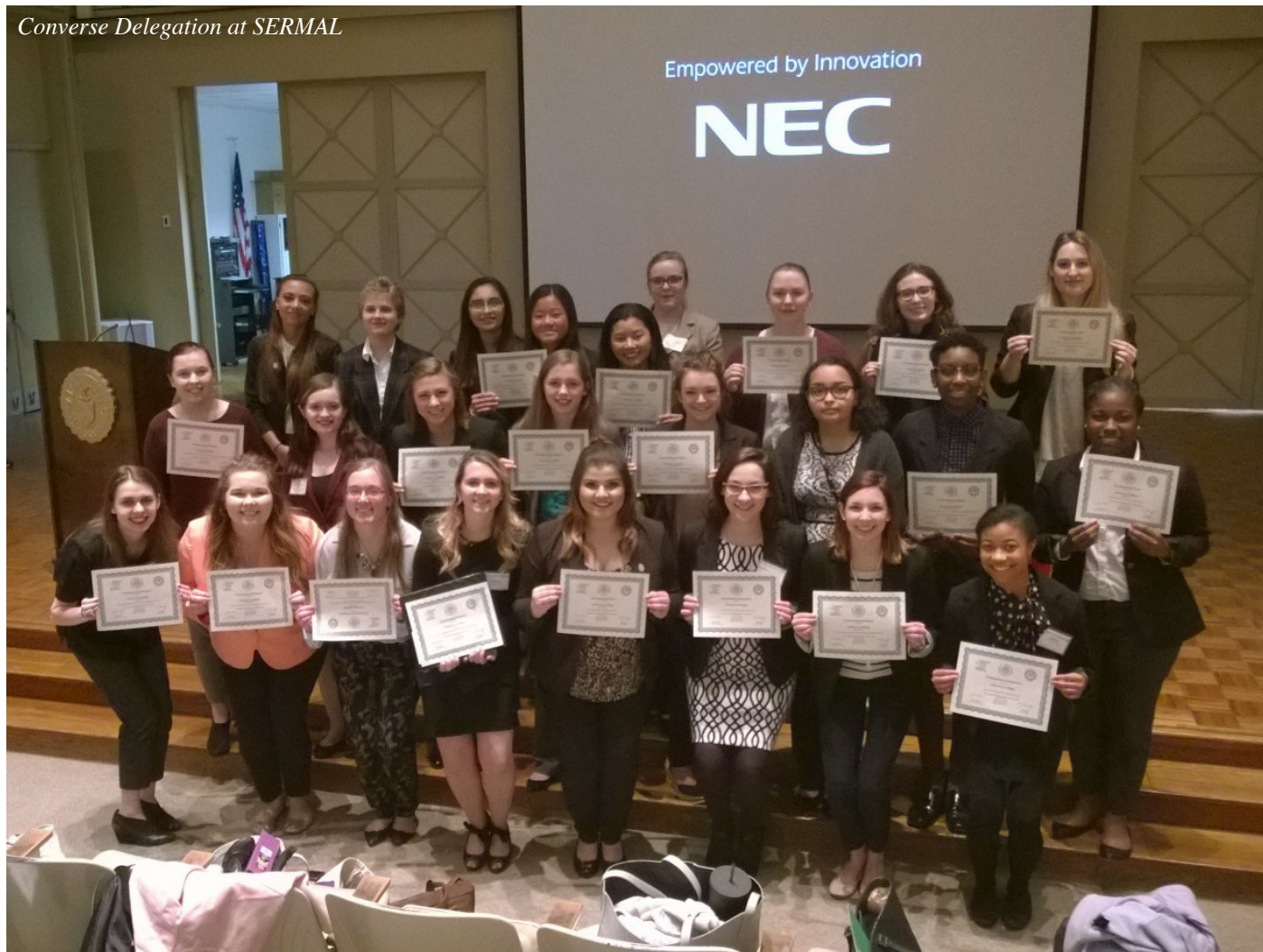
Converse Delegation at SERMAL