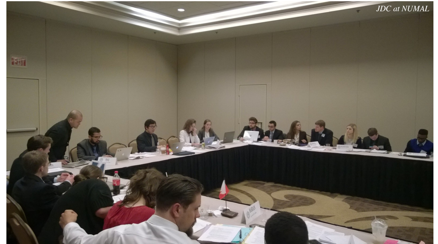
JDC at NUMAL

snowed in during two blizzards; student mishaps and crises of every imaginable kind; and the constant personnel and policy changes of the National Council provide a myriad of stories for my memoirs. However, bottom line, MAL has been a central event of my academic career.