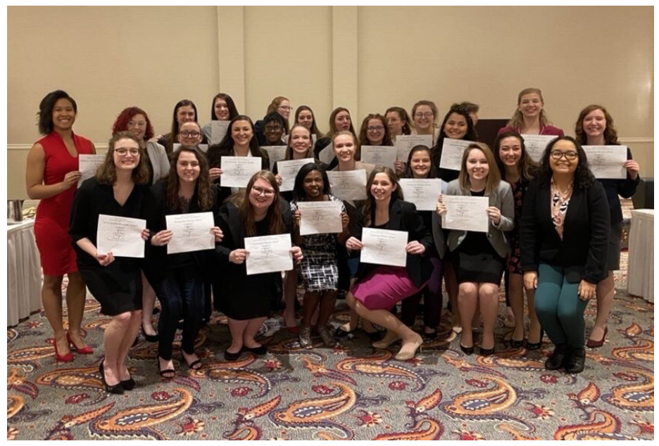
My delegation as Head Delegate and Secretary General of NUMAL 2021

stone to my wonderful career in Model Programs. My personal story follows.