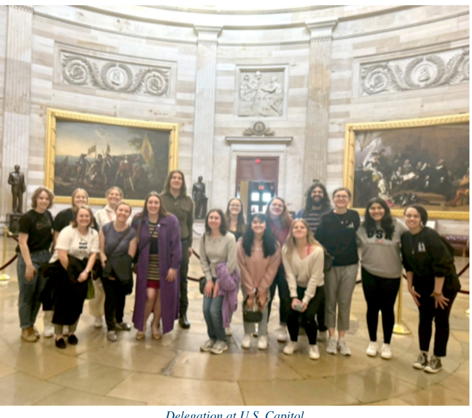
Delegation at U.S. Capitol

The 2024 National University Model will meet March 22-24 at a yet undetermined location.