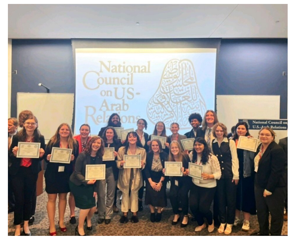
Outstanding NUMAL Iraq Delegation