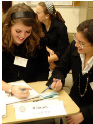
Delegates representing Bahrain discuss the merits of a resolution in the Council on Social Affairs at the Atlanta, Georgia High School Model Arab League at The Marist School