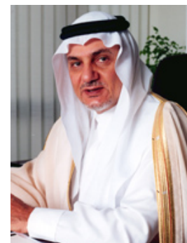
HRH Prince Turki Al Faisal Al Sa'ud

In March he served as the principle escort and guide on separate Malone Fellowship in Arab and Islamic Studies visits to Oman and Yemen. On May 29, the National Capital Rotary Club presented honored him with its Local Giant Leadership Award . The award was the first of its kind ever presented by the organization.