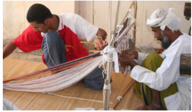
Omani village pitweavers work their magic in producing one of the multi-colored headdresses worn by Omanis.