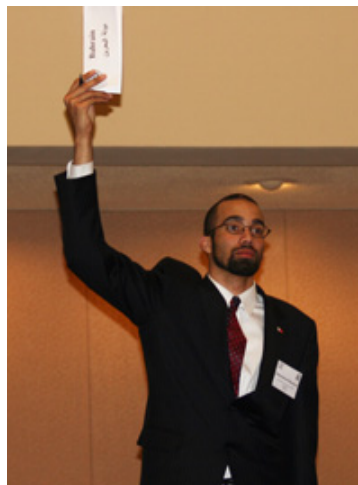
A student casts his delegation's vote during the Summit Session of the National University Model in Washington, D.C.