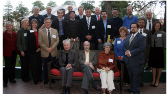
During the National Model, 25 faculty advisers, many of whom are alumni of the Council's Malone Fellowship in Arab and Islamic Studies Program, gather for a group picture