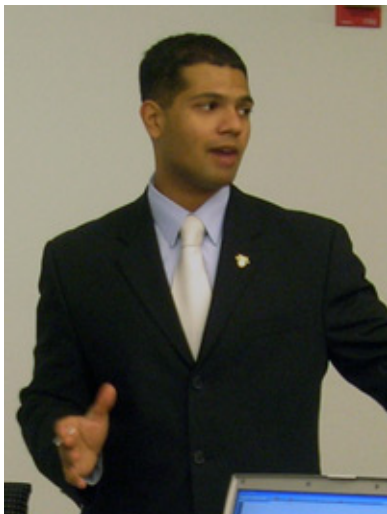
A student delegate delivers a speech in the Council on Palestinian Affairs at the Northeast University Model in Boston, Massachusetts