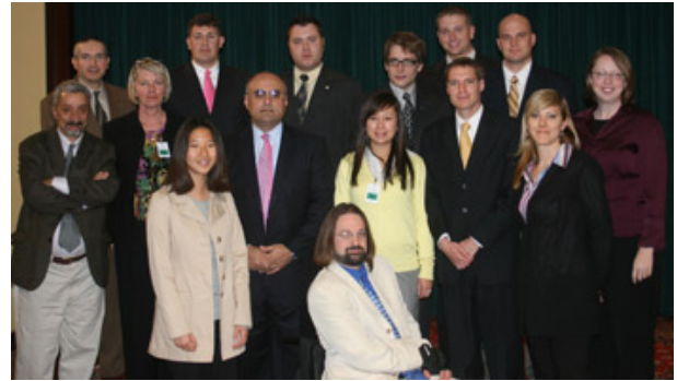
During the National University Model in Washington, D.C. most students have the opportunity to visit and be briefed by diplomats at the embassy of the country they are representing. Pictured here are (L) students from Northeastern University at the Embassy of the Arab Republic of Egypt and (R) students from the University of Utah at the Embassy of Saudi Arabia.

In April 2008, the National Council, in partnership with the Bilateral U.S.-Arab Chamber of Commerce ( www.bilateralchamber.org ), held the inaugural Bilateral Model Arab League in Houston, Texas at the University of St. Thomas. This was the first Model to be held in Houston. As a result of its success, the Council and the Bilateral Chamber will administer two Models in Houston in 2009. The additional Model will be for Houston's secondary school students.