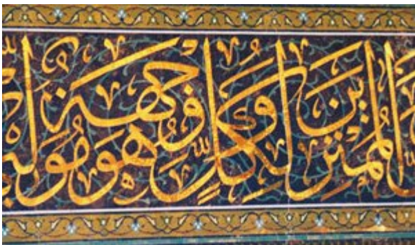
Gold inlaid Quranic calligraphy adorns the inner walls of the Grand Mosque in Oman's Capital Territory.