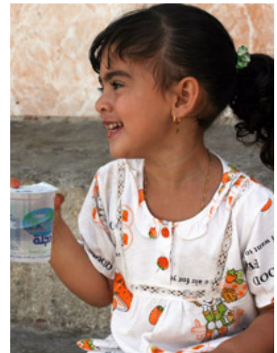
National Council Malone Fellows encounter Oman's leaders of tomorrow in the Sultanate's countryside during this year's study visit.