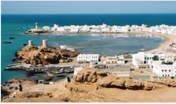
The Indian Ocean port of Sur, home to many craftsmen of Oman's traditional wooden sailing dhows and its merchant captains of the sea who still sail to and from the Gulf, Africa, and lands east.