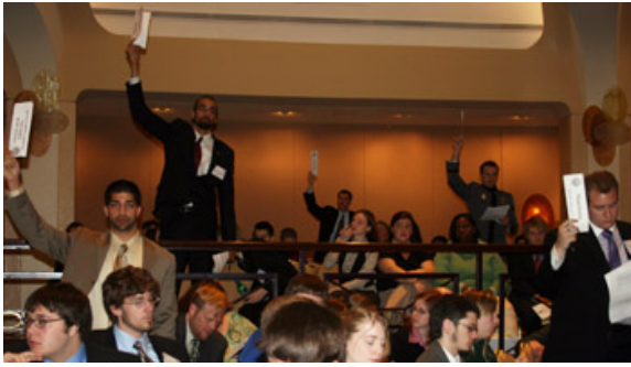
Students cast their votes on resolutions during a Model Summit Session - the National Council sponsored and administered 13 Models during the 2007-08 school year in 11 U.S. cities