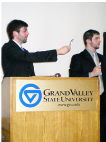
Students tally votes on a motion at the 2008 Michigan Model Arab League at Grand Valley State University, near Grand Rapids, Michigan

In April 2008, the National Council, in partnership with the Bilateral U.S.-Arab Chamber of Commerce ( www.bilateralchamber.org ), held the inaugural Bilateral Model Arab League in Houston, Texas at the University of St. Thomas. This was the first Model to be held in Houston. As a result of its success, the Council and the Bilateral Chamber will administer two Models in Houston in 2009. The additional Model will be for Houston's secondary school students.