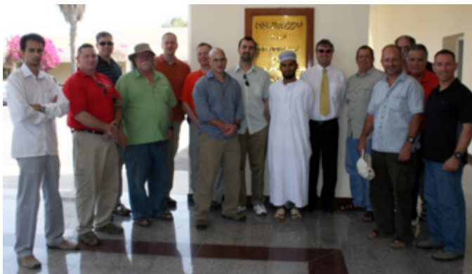
Malone Fellow delegation on the Sixth Annual Cultural Immersion Visit to the Sultanate of Oman in March