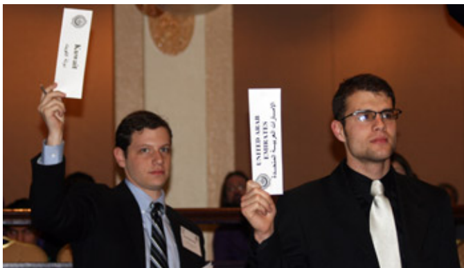
Students vote on a resolution during the Summit Session of the 2008 National University Model Arab League/Arab-U.S. Youth Leadership Development Program in Washington, D.C., one of 13 administered by the National Council for 2,000 students and 220 faculty advisers yearly in 11 cities throughout the United States

Few Americans have received comprehensive training or firsthand experience in practicing and mastering such public affairs leadership skills. One obviously has to study and conduct research to prepare for the Models. Numerous participants in the Models benefit from assistance provided by faculty advisers the National Council has taken to the Arab world or others within the Council's network of supporters and volunteers. The time limitations placed on speaking for or in opposition to a measure being considered mirror those employed in the debate of public policy issues anywhere. The skill sets practiced and acquired in the course of debate are ones that will serve the students well regardless of the eventual career they elect to pursue.