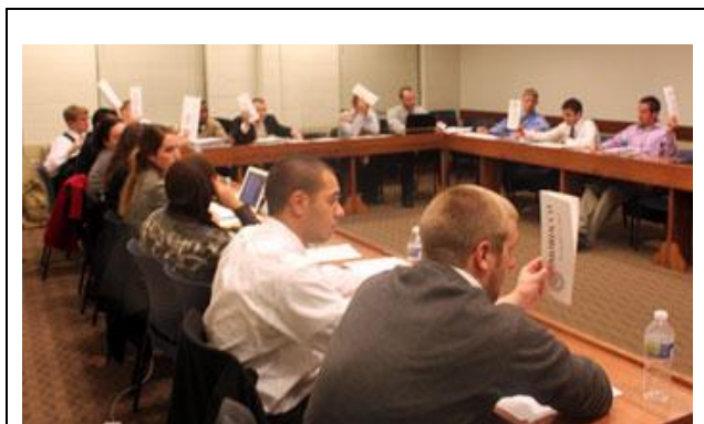
Student delegates vote on an amendment to a resolution in the Council on Environmental Affairs at Georgetown University's Capital Area Model.

The National Council, in partnership with the Georgetown University Graduate School of Foreign Service's Center for Contemporary Arab Studies, hosted the Third Annual Capital Area Regional Model November 12-