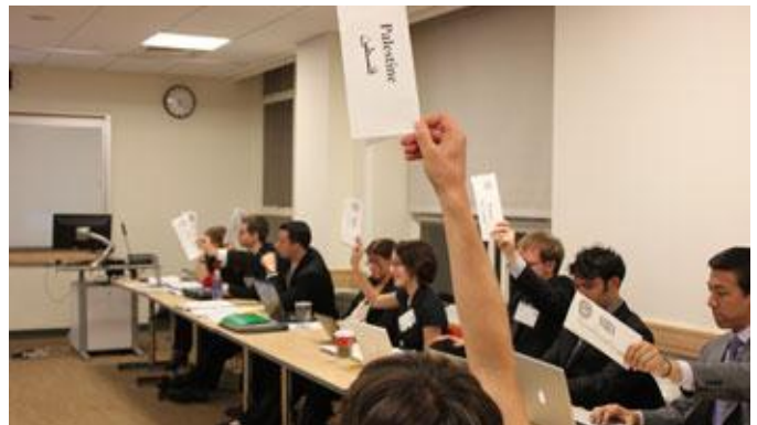
Student delegates vote on a resolution in the Council on Political Affairs.