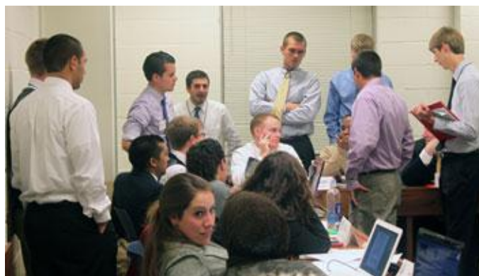
Student delegates confer while drafting a resolution in the Council on Political Affairs at the Capital Area Model.