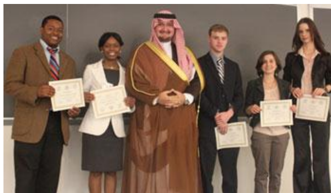
Student delegates with HRH Prince Abdul Aziz Bin Talal Bin Abdul Aziz Al Saud display their certificates for Outstanding Representation of their assigned country's policies and positions.