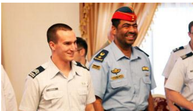
A U.S. Air Force Academy Cadet with an instructor from the Khalifa bin Zayed Air College.