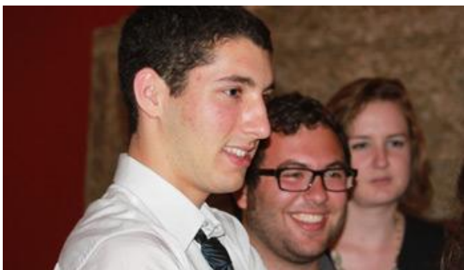
The interns gather for a final meeting at the Summer Wrap-Up Session before returning to their home universities to continue their studies.

Accordingly, one of the program’s objectives is to increase the number of foreign affairs practitioners that are as knowledgeable of Arabia and the Gulf’s internal and external dynamics as possible. To that end, most of the lectures address issues related to the member-states’ systems of governance, political realities, economic and social development, as well as foreign affairs, on one hand, and, on the other, the relationships of the United States with this Arab sub-region and its neighbors -- and vice versa .