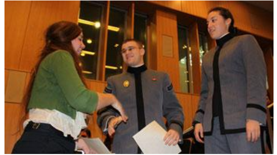
The Northeast Regional Model Secretary-General awards a certificate to student delegates from the United States Military Academy at West Point for outstanding representation of their country's policies and positions.

The 2011 Northeastern University Regional Area Model (NERMAL), convened at Northeastern University in Boston November 4-6, succeeded on multiple levels. Student delegates debated and passed resolutions on numerous diverse topics reflecting the real-life domestic dynamics and policy challenges presently facing all 22 of the League's Arab member-states. Schools participating in the 2011 Northeastern Regional Model included: Simmons College, University of Massachusetts Lowell, Northeastern University, Colby College, University of Massachusetts Boston, Fitchburg State University, Converse College, University of Pittsburgh, Bard College, Emmanuel College, Endicott College, United States Military Academy at West Point, Massachusetts Institute of Technology, Drake University, and Roger Williams University.