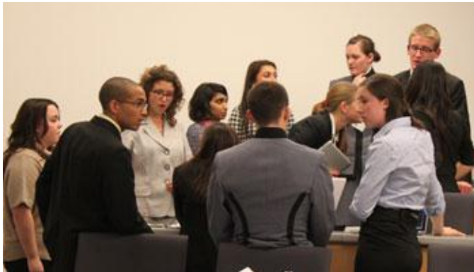
Student delegates in the Council on Palestinian Affairs collaborate in drafting a resolution.