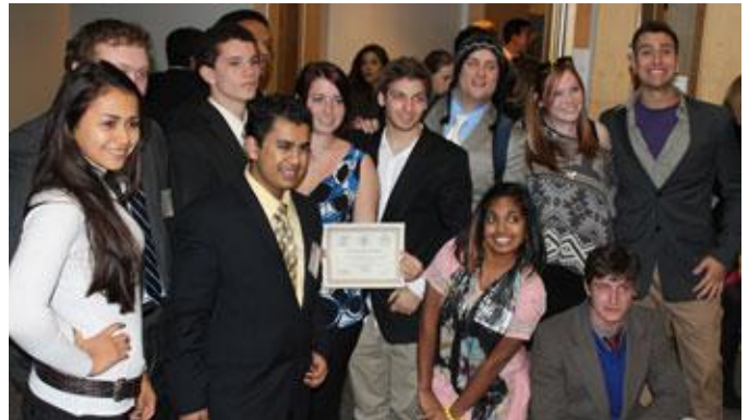
Student delegates display their award for Outstanding Delegation at the Northeast Regional Model.