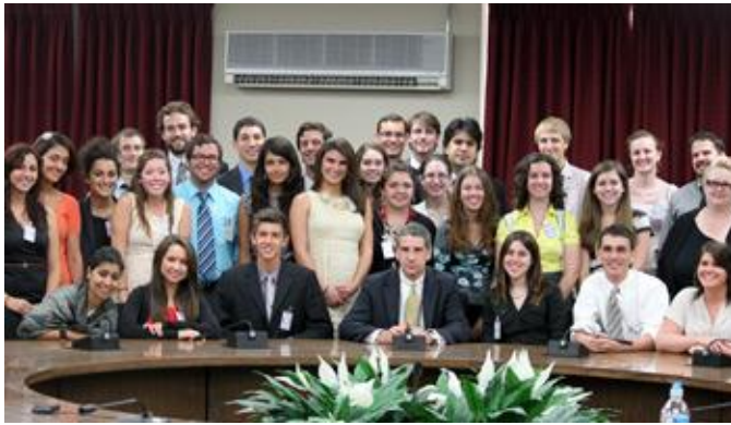
National Council Internship Program participants visited and were briefed by diplomats at the U.S. Department of State.