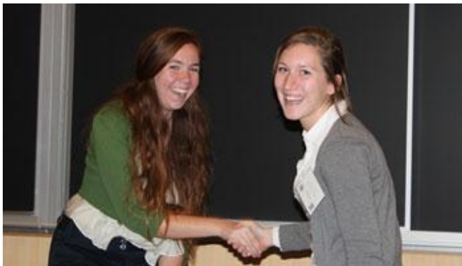
The Northeast Regional Model Secretary-General congratulates a Council Chair on her successful leadership of the Council of Arab Economic Ministers.