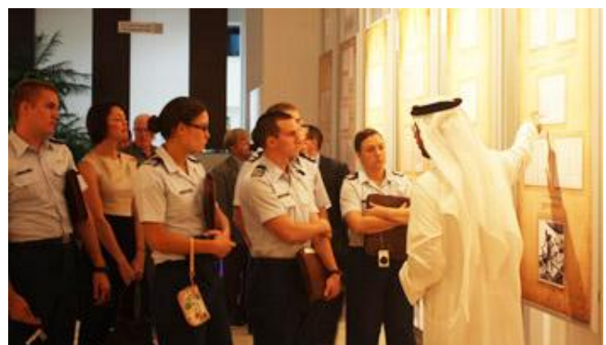
The Council's U.S. Air Force Academy delegation visits the UAE Ministry of Presidential Affairs' National Center for Documentation and Research in Abu Dhabi, one of the foremost centers of its kind in the Arab and Islamic worlds.