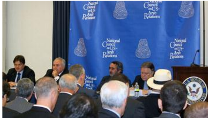
The National Council hosted a briefing event featuring leaders from the Gulf Research Center at the Rayburn House Office Building on Capitol Hill.

Audio, video, and pictures from the program are available on the National Council's website: ncusar.org , and on the Council's Facebook page: facebook.com/ncusar .