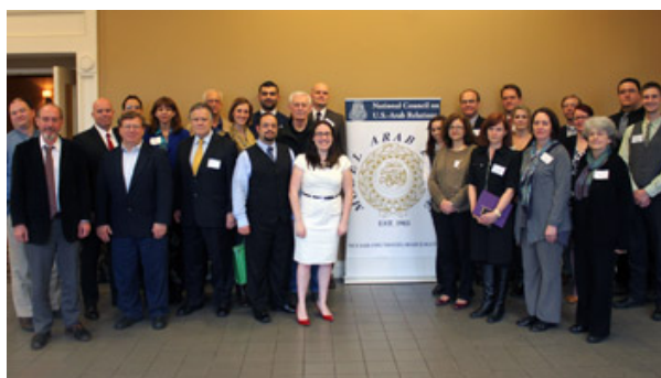
Model Arab League faculty advisors, many of them alumni of the Council's Malone Fellows in Arab and Islamic Studies Program, at the 2014 National Model Arab League in Washington, DC.