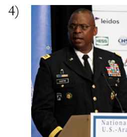
General Lloyd Austin III