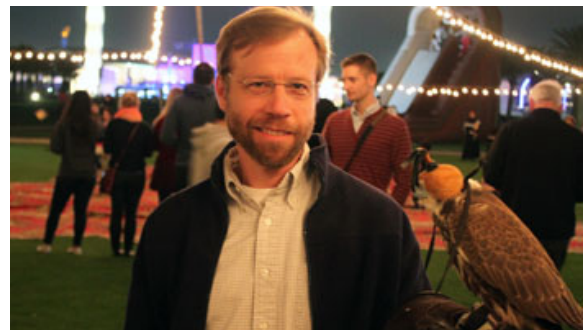
The delegation attended a National Night celebration hosted by Northwestern University - Qatar, whose branch campus in Education City offers degree programs in journalism and communication.