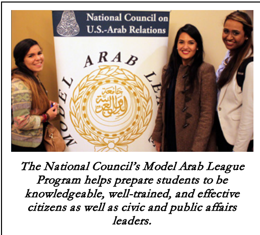
The National Council's Model Arab League Program helps prepare students to be knowledgeable, well-trained, and effective citizens as well as civic and public affairs leaders.

In the following pages are reports on the National Council's programs in Arab-U.S. relations education, training, and leadership development. Of special note are accounts of how, in close association with the Council and its staff, approximately 2,000 university and secondary school participants expanded their knowledge, understanding, and ability to share with others what they have learned and continue to learn through and with the Council. "Learn what?" one might ask. The answer: about the Arab world, about Arab culture, about Arab society, about Arab economics, governmental structures, political dynamics, international relations, and most important, about doing whatever is necessary to strengthen and empower the innumerable positive benefits of the overall U.S.-Arab relationship.