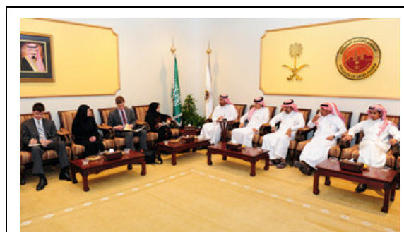
The National Council's Model Arab League student delegation visits the Royal Commission for Jubail.

Upon arrival in Saudi Arabia, the delegation visited Riyadh, the capital, in the Central Province; Dhahran, Saudi Aramco, and Jubail Industrial City – one of the world's most vital energy industry-centric cities, located in the Eastern Province; and Jeddah, long referred to as “Bride of the Red Sea” and the country's pre-eminent commercial center, in the Western Province. The delegation also visited the King Abdulaziz Historical Center, the Alwaleed Bin Talal Foundation, the King Abdulaziz Center for National Dialogue, the King Faisal Center for Research and Islamic Studies, the Prince Sultan Center for Science and Technology, the Khadija Bint Khuwalid Center, Old Jeddah, and the Nafisa Shams Academy for Arts & Crafts. They also had the extraordinary opportunity to visit practically all of the Kingdom's most prominent institutions of higher education. Included were: King Saud University, Yamamah University, King Fahad University of Petroleum and Minerals, King Abdullah University of Science and Technology, Queen Effat University, and King Abdulaziz University. The study visit throughout enabled the students to meet Saudi Arabians from all ages and walks of life.