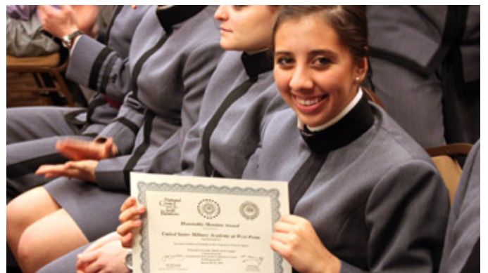
A cadet from the United States Military Academy at West Point, New York displays her Outstanding Delegate certificate for her representation of Somalia in the Council on Political Affairs.