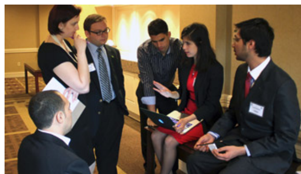
Students work to draft a resolution for the Council on Environmental Affairs at the National University Model Arab League in Washington, DC.