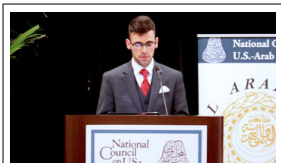
A student addresses the Plenary Session at the National Model in Washington, DC.

As in real life public policy debates, participants have no choice if their goal is to be successful but to be as well prepared, organized, disciplined, and focused as possible. In addition, they must be able to advocate their viewpoints with facts, command of language, clear oral and written expression, and the passion of their convictions as well as all the logic, strength of argument, and erudition they can muster in support of their position. What is more, participants have no option but to try to be as effective as they can within prescribed requirements, limitations, and procedures, including tight time constraints. For example, in keeping with established rules of order and depending on the issue and procedural dynamics in