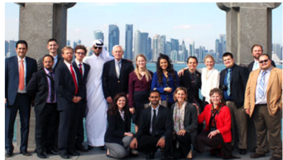
The 15 study visit participants –10 students and 5 faculty members – were selected on the basis of their outstanding performance in the National Council's University Model Arab League Student Leadership Development Program.