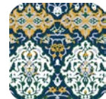
Arabia, the Gulf, & the GCC Blog