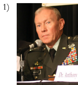
General Martin Dempsey

Specialists at National Council Arab-U.S. Policymakers Conferences have included, in clockwise order from the top left, a (1) Chairman of the U.S. Armed Forces Joint Chiefs of Staff; (2) former Director General of Saudi Arabia's General Intelligence Directorate as well as Ambassador to Great Britain and the United States; (3) Commissioner of the United Nations Human Rights Council mandated Commission of Inquiry on the Syrian Arab Republic and former Under Secretary General and Commissioner-General of the United Nations Relief and Works Agency for Palestine Refugees in the Near East; (4) current Commanding General of U.S. Central Command, the lead forward deployed U.S. armed forces command responsible for protecting U.S. national security-related interests in 20 nations, stretching from the Nile Valley, the Levant, the Fertile Crescent, Arabia, the Gulf, and South and Central Asia; (5) former multiple-times Deputy Assistant Secretary at four U.S. Cabinet-level posts; (6) the Department of Defense's immediate past lead analyst on Iraq; (7) Kuwait University Professor of International Relations and Chairman of its American Studies Unit; and (8) the United Arab Emirates Minister of Foreign Trade: