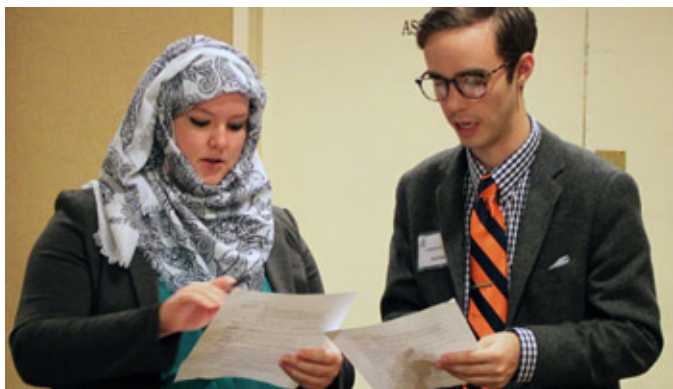
Student participants review amendments to a resolution in the Council on Social Affairs at the National University Model in Washington, DC.