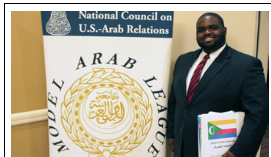
MAL helps prepare students to be knowledgeable, well-trained, and effective citizens as well as civic and public affairs leaders.

Beyond the proven leadership development skills and achievements that are the hallmarks of the Models' experience, a further incentive in recent years has been student and faculty awareness of the increasing number of extraordinary additional benefits for which Model alumni become eligible. Indeed, participation in the Models has become a gateway for Model delegates winning National Council study abroad scholarships. Such scholarships grant the recipients entry into, first, the Council's Annual University and High School Student Summer Internship Programs in the nation's capital; second, the Council's Arabic Language and Study Abroad Programs in Egypt, Jordan, Lebanon, Morocco, and Oman; and, third, inclusion in study visits to Qatar and Saudi Arabia.