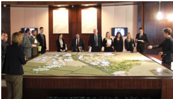
The Model Arab League delegation learns about Education City, an initiative of the Qatar Foundation that hosts branch campuses of some of America's and other countries' leading universities as well as other educational and research centers.

The delegation visited Qatar's Aljazeera Media Network, Aspire Zone (also known as Doha Sports City), Mada (Qatar Assistive Technology Center), Ministry of Foreign Affairs, Ministry of Information and Communications Technology, National Human Rights Committee, Qatar Foundation, Qatar International Academy for Security Studies, Ras Laffan Industrial City, and the Supreme Committee for Delivery & Legacy. They also explored the Museum of Islamic Art, Souq Wagif, Katara Cultural Village, and attended a Qatar National Night celebration hosted by Northwestern University–Qatar. At the latter event, female and male students and faculty alike learned how to hold falcons, regarding which Arabs for centuries have had no peers in their skills at training these birds of prey for hunting in the desert. In addition, the female participants opted to be hennaed . As women at marriage and other festivals are often wont to do, they had their hands, wrists, and forearms painted in varied Arabesque designs with a nonpermanent orange-brown vegetable dye.