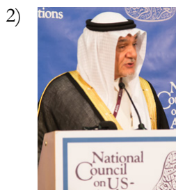
HRH Prince Turki Al Faisal