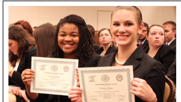
Student delegates display their awards for being an "Outstanding Delegate" at the National University Model Arab League in Washington, DC.

opportunity to learn or practice it before, they soon acquire a mastery of the art – the students wrangle with one another over a broad and diverse range of policy-centric challenges and opportunities. Examples include the proper course of concerted policy formulation and action with regard to Palestinian affairs and ongoing issues related to governance, security, stability, and development in Egypt, Iraq, Lebanon, Libya, Saudi Arabia, Syria, Yemen, and more, together with matters pertaining to human rights, justice, defense cooperation, and the environment.