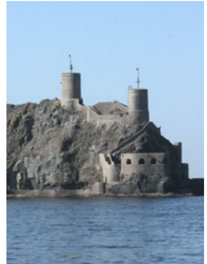
Fifteenth century Fort Mirani in Muscat.