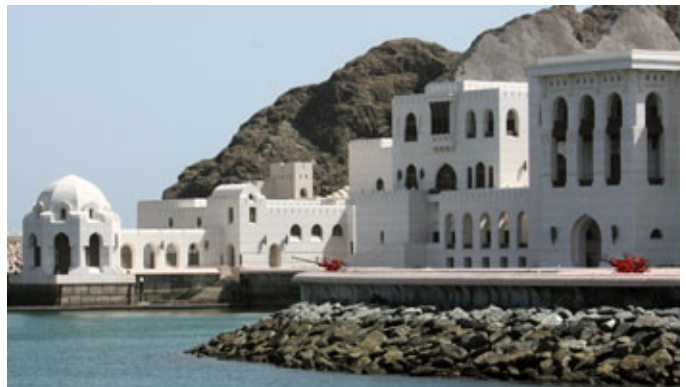
The waterfront of Muscat, capital of Oman and one of Arabia's most historically fabled ports.