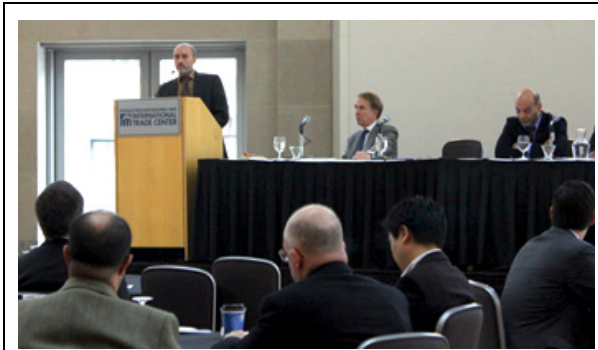
H.E. Emhamed Elhemmal, Libyan Deputy Minister Of Health, addresses a National Council Public Affairs Briefing on Libya's healthcare sector.

On December 4, 2013, the National Council and The American Libyan Chamber of Commerce & Industry (ALCCI) hosted a special public discussion with Libyan Deputy Minister of Health Emhamed Elhemmal