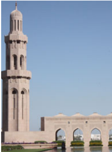
An exterior view of the Sultan Qaboos Grand Mosque in Oman's Capital Territory.