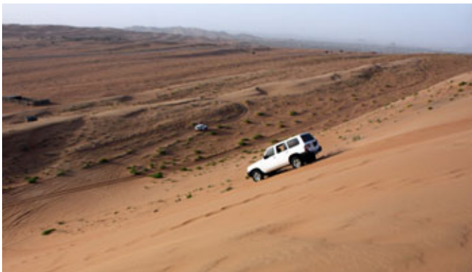
Malone Fellows explored the dunes of the Sharqiyyah Sands, an eastern extension of the Rub' Al-Khali (The Empty Quarter), the world's largest desert.