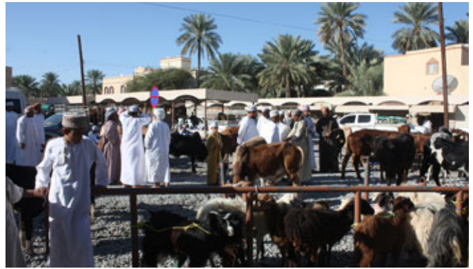
Malone Fellows explored the vibrant market in Sinaw, in the eastern region of Oman where they were able to walk among and commune with men and women in their traditional dress, peruse the locally produced handicrafts in gold and silver, and observe the brisk sales in fish, goats, and household wares.