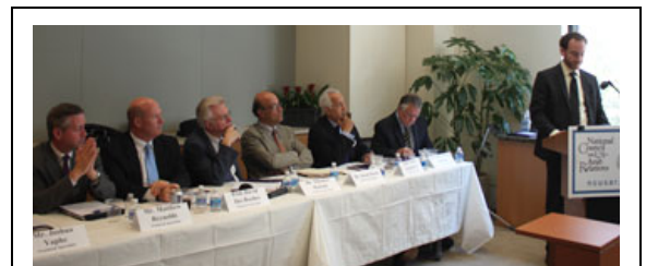
National Council Public Affairs Briefing examining the implications of ongoing regional crises.