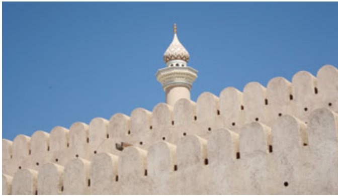
A view of the centuries-old fort adjacent to the Grand Mosque in Nizwa, an historical center of scholarly learning and traditional education that has long been closely linked to Ibadhi Muslim communities in Algeria, Libya, East Africa, and elsewhere.