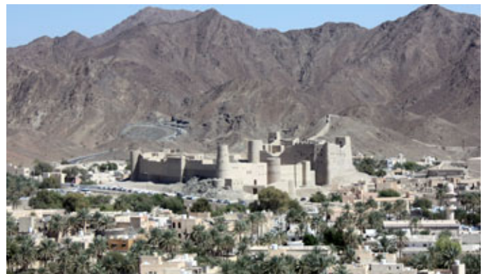
One of Oman's many inland fortresses and traditional walled settlements, Bahla, presently under restoration, has been designated by the United Nations as a World Heritage Site.