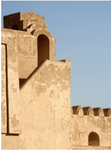
The Fellows visited Jabrin Castle, built in the 17th Century when Oman's capital moved there from Nizwa.