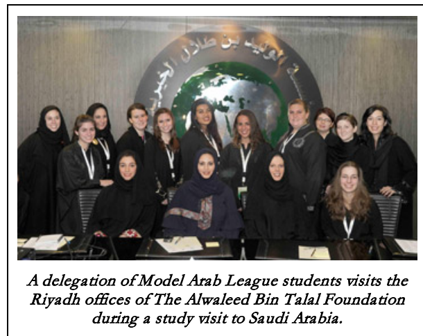
A delegation of Model Arab League students visits the Riyadh offices of The Alwaleed Bin Talal Foundation during a study visit to Saudi Arabia.

The grant, along with contributions from other Council supporters, has helped immensely. It has enabled the Council not only to grow and reach an expanding audience. It has also assisted in the Council’s efforts to continue to promote and build as well as strengthen and protect the foundation of a relationship between the United States and its Arab partners, friends, and allies that rests on as solid and enduring a foundation as possible.