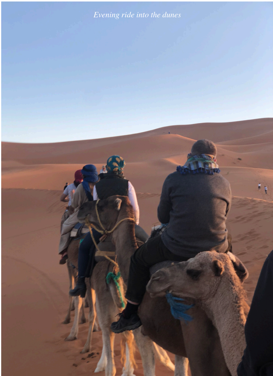
Evening ride into the dunes

The first lesson that I implore readers to adopt in travel and study abroad is not to be a tourist. This is not an encouragement for people to avoid exploring new locations with zeal, but a recommendation for a new approach to travel. While standing out is often a positive trait, I found that the best way to travel is to blend in. Learn from the locals, embrace the local language, and learn the culture. There is a difference between cultural appropriation and embracing and learning new cultures. Learn