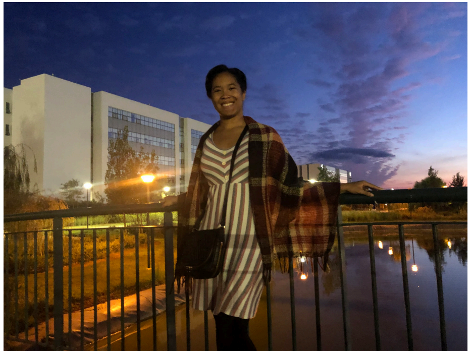
Evening on the URI campus

My other lesson is simple but often the hardest to put in practice. The singer Sonny Curtis said it best “love is all around, no need to waste it.” While I am sure Sonny in no way was talking about the beauty of Morocco in this 1980s hit, this lyric resonates with the most important lesson that I learned in Morocco: embrace the beauty around you. Although the experience had challenges, it was beautiful. Once travelers realize that the world is not your hometown, the experience of travel is richer. Food, drinks, bathrooms, weather, lifestyle is different when you leave