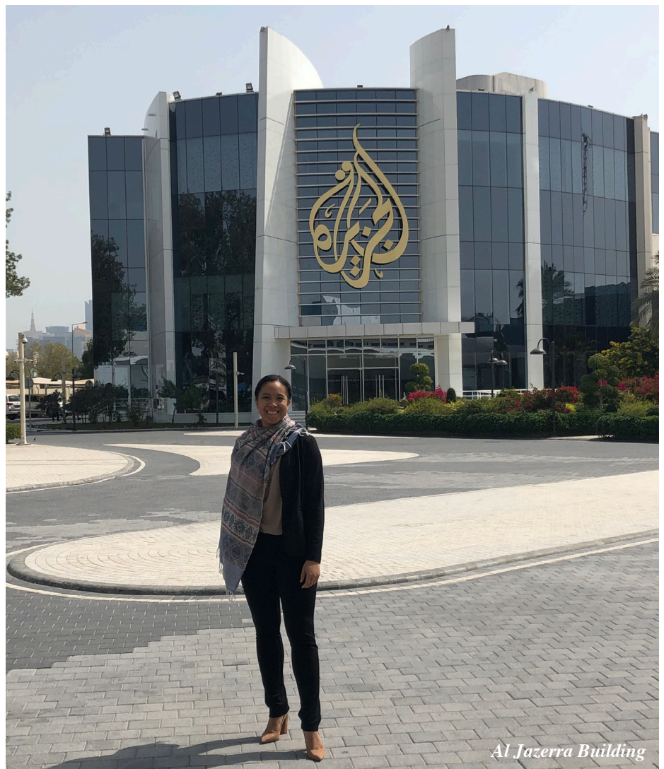
Al Jazeera Building