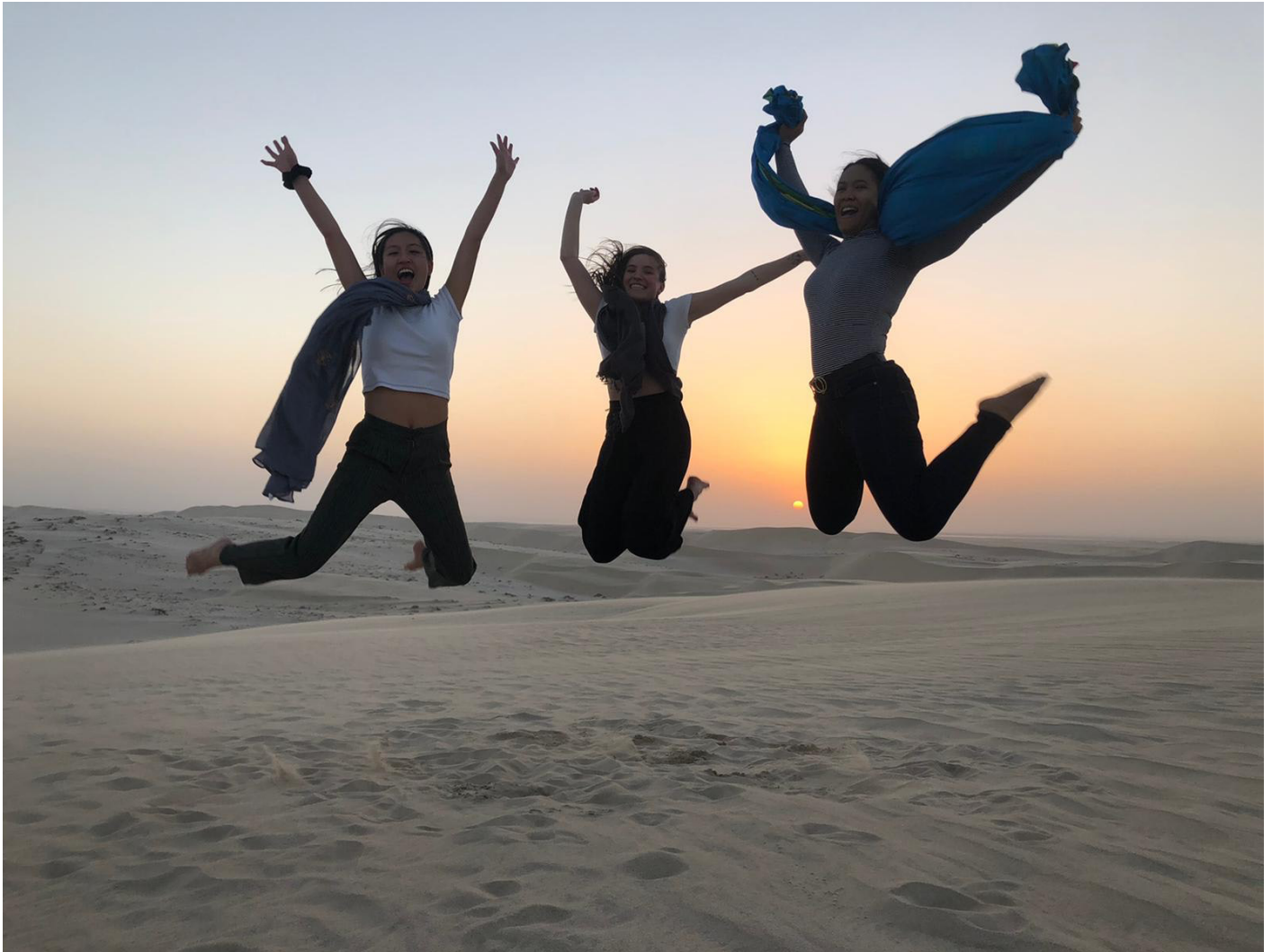
In the Desert

wide diary company in under a month to securing the World Cup 2022, Qatar has developed strategic initiatives that show the nation's resilience and innovative vision for the future. The admiration for the government can be seen throughout the country as the Emir's face is on buildings, t-shirts, bumper stickers, and magnets. The country has masterfully created an identity that was designed and practiced by the Qatari people and government in tandem. This strong and vibrant national identity will show