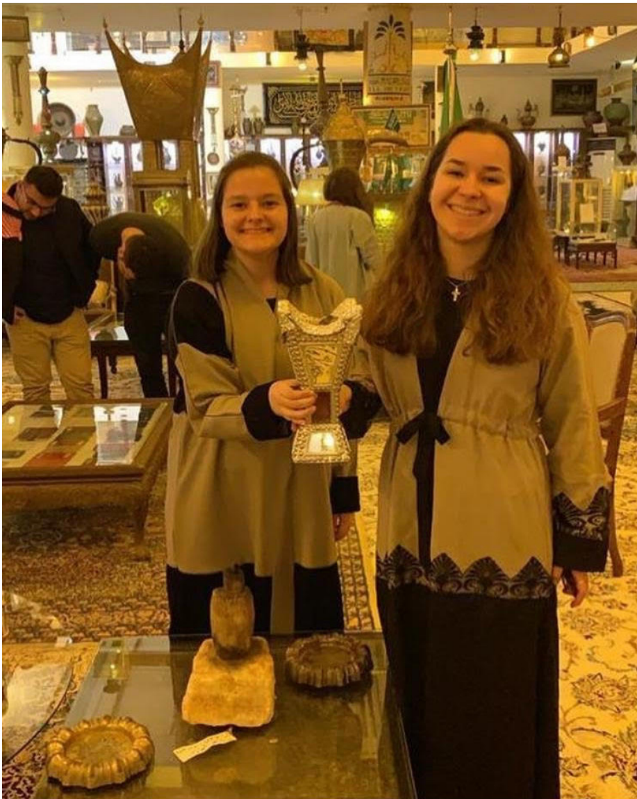
Shopping in a store

The Saudi Vision 2030 plan is a strategy to diversify the Saudi economy and develop the country's infrastructure, capacities, and influence, which will allow the Kingdom to compete economically on the international stage. The Saudi Vision 2030 plan spearheaded this modernization through progressive goal setting. The plan commits to "providing opportunities for all" through various means and "unlocking the talent, potential, and dedication of our young men and women". This inclusion of all Saudis, specifically women, in the language of the 2030 Plan paved the path towards more progressive laws for Saudi women. As of 2017, laws were passed in Saudi Arabia that granted women equal treatment in the workplace, permitted them to obtain family documents from the government, and allowed them to obtain a passport and travel without permission from a wali, or a male guardian. 1 In addition, women can get a driver's license, can spectate sports, and no longer have to wear an abaya so long as they dress modestly. 2 Although these freedoms are put into law, do they actually reach the lives of Saudi women? This question, among many others, was what I aimed to answer on my trip to the Kingdom.