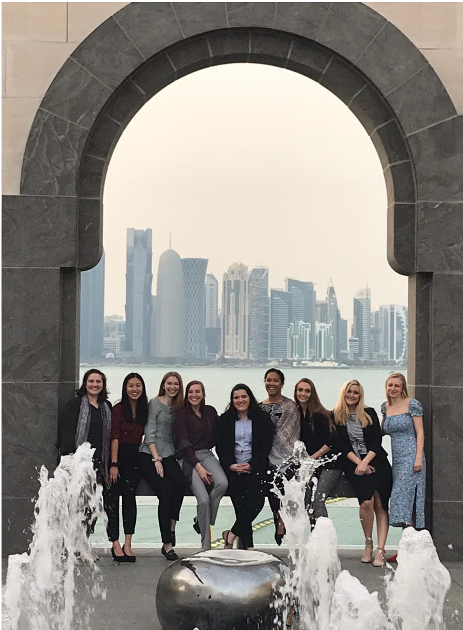
Group at the Museum of Islamic Art

Despite the initial devastation of being separated from their Gulf partners, the people of Qatar joined together in solidarity. The blockade served as a catalyst for the people of Qatar and the government to join together and create an identity for Qatar separate from the previous broader regional identity. The people celebrate their history of former British rule as it developed Qatar's capital Doha into a multicultural city. Prior to the conflict, the Qatari government had to balance the needs of the GCC and Qatar. While still actively supporting the GCC, Qatar now can concentrate more on its own affairs. From establishing a nation-