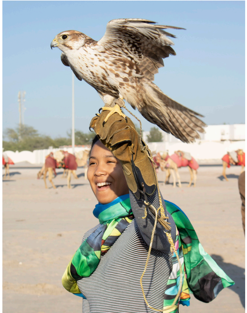
Kennedy with friend

as Bahrain, Saudi Arabia, the United Arab Emirates, Yemen, Egypt, and the Maldives severed diplomatic ties with Qatar. Saudi Arabia closed its airspace to all Qatar Airways flights. Soon after, all the GCC countries, with the exception of Oman and Kuwait, ordered all of their own citizens to leave Qatar, and they severed financial ties and trade agreements. Kuwait and Oman remain neutral, and in 2017,