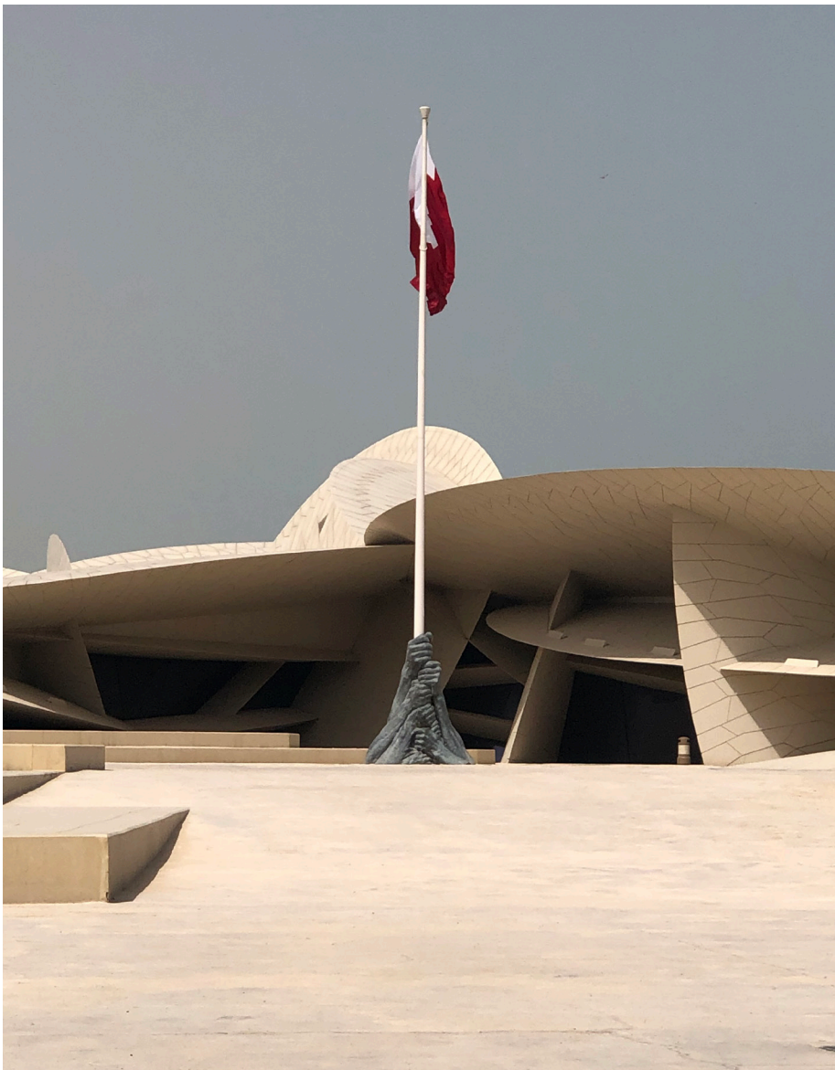
The National Museum

My adviser asked me to pick one policy issue from the trip to discuss. After much reflection, I decided to speak about Qatari national identity and the impact and reaction to the recent/present blockade of the nation. This quote from the wall of the National Museum of Qatar says it succinctly: "Qatari identity is rooted in this unique ge-