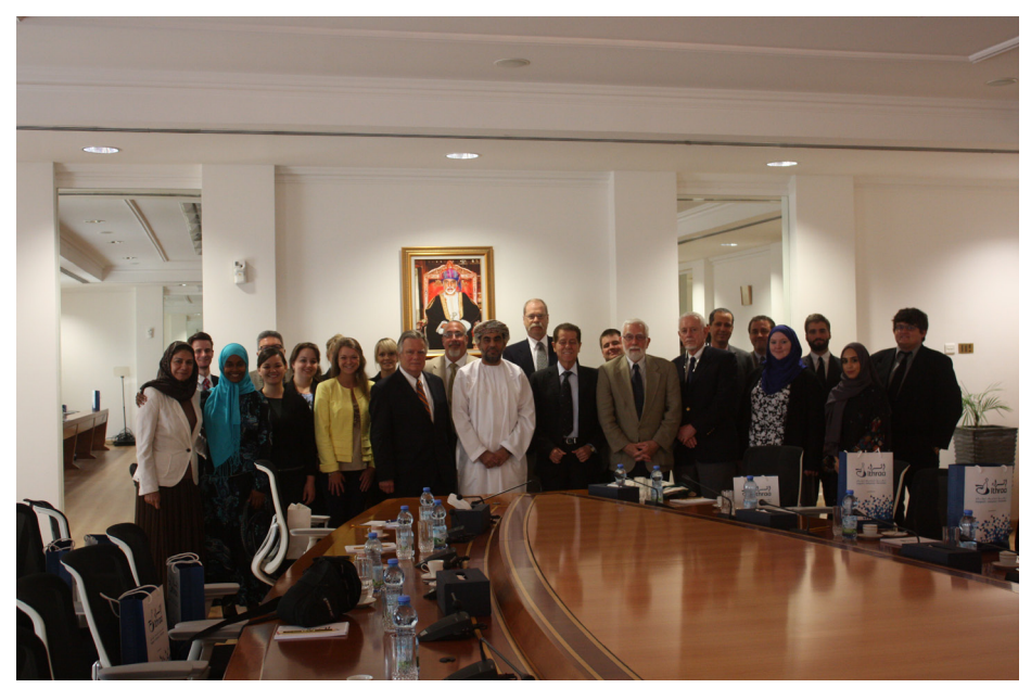
Meeting at ITHRAA, Inward Investment and Export Developent Agency

Converse College 580 East Main Street Spartanburg, SC 29302