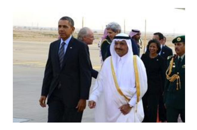
Prince Khaled bin Bandar greets President Barack Obama upon his arrival in Riyadh in March 2014.

Minister of the Interior, HRH Prince Mohammad bin Nayef bin Abdul-Aziz, and Minister of the Saudi Arabian National Guard, HRH Prince Mit'eb bin Abdullah bin Abdul-Aziz, Prince Khaled's visit will most likely continue discussions on joint efforts to fight the Islamic State in Iraq and Syria (ISIS). Four months after the formation of the U.S.-led international coalition to degrade and defeat ISIS, Prince Khaled will review past accomplishments, study lessons learned, and coordinate future steps to combat what has become a serious threat to peace and security in the Arab East.