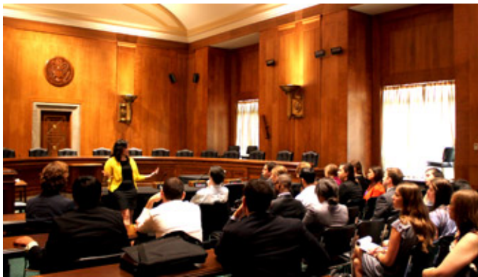
Internship program participants visited the Senate Foreign Relations Committee and received a briefing from Committee staff members.

The Arab-U.S. relations programs, activities, and functions represented by the eighteen organizations and corporations that provided the professional work experience component of the past year's program are varied. Included among their missions and activities are U.S.-Arab educational development and exchanges, bimonthly and quarterly publications, humanitarian relief services, public broadcasting, academic area studies, international transportation, foreign trade, and peace and justice advocacy. An additional feature of the Internship Program is site visits to public and private sector institutions such as Arab embassies, energy corporations, Congressional Committees, and government agencies.