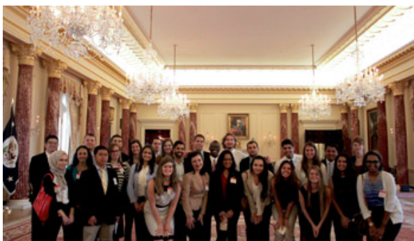
The interns visited the U.S. Department of State during one of their weekly excursions that allowed them to explore some of America's most important government institutions.