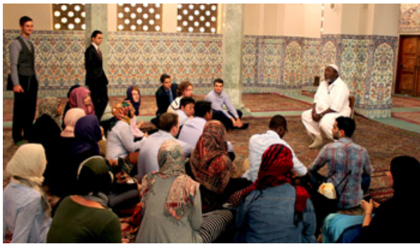
National Council Internship Program participants visited The Islamic Center of Washington, a mosque and Islamic cultural center on Embassy Row, where they met with and were briefed by the local Imam.