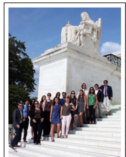
Internship program participants' experience is one that could not be duplicated or paralleled by the students' university studies on campus.

Accordingly, one of the program's educational objectives is to increase the number of foreign affairs practitioners who are as knowledgeable of Arabia and the Gulf's internal and external dynamics as possible. To that end, most of the lectures and discussion sessions address issues related, on one hand, to the dynamics of the member-states' systems of governance, political realities, economic and social development, and their foreign relations, and, on the other, American relations with this Arab sub-region and its neighbors – and vice versa .