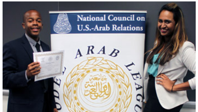
National Council Internship Program participants joined other students working and studying in Washington, DC in a one-day Summer Model Arab League at Georgetown University.