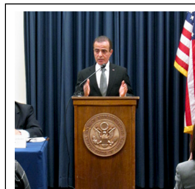
H.E. Mohammed Jaham Al Kuwari, Ambassador of Qatar to the United States, addresses an April 2014 National Council Congressional Briefing Event in the Rayburn House Office Building.